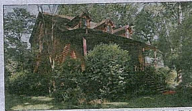
This home at 3533 Lakeshore Drive and its surroundings, shown at left and below, capture the flavor of the scenic neighborhood and the winding street that overlooks Lake Jackson.